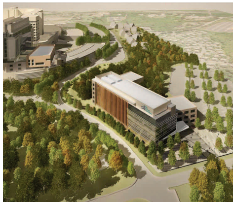
Artist Rendering of New Facility

Farmington — The non-profit research organization Jackson Laboratories has decided to locate its new Genomic Research Center in Connecticut. The facility will be located next to the University of Connecticut Health Center in Farmington. A $290 million incentive package consisting of a forgivable loan and a state research grant has been approved by the CT legislature and bond commission. In exchange Jackson Laboratories will build a 173,000 research institute and employ more than 300 people with most of the jobs being scientific. The development is expected to spur other life science jobs and connect with Yale University and a thriving biotech community 45 minutes away in New Haven. The facility is set to open in 2014.